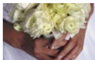
Weddings & Functions