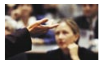
Conferences & Meetings